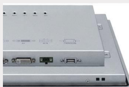
Rugged steel structure