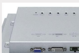
OSD control buttons on the rear panel