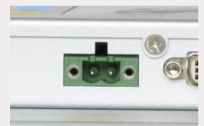
Phoenix terminal using fastening type power connector