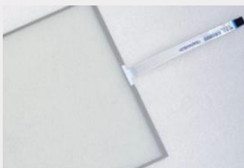
Using precision resistive touch screen